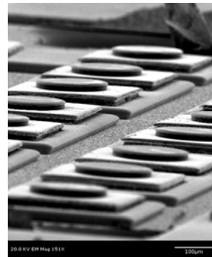
An array of thermal bumps in manufacturing

At the core of Nextreme's thin-film modules is the thermal copper pillar bump, also known as the "thermal bump," made from thermoelectric materials embedded in solder bumps. Unlike conventional solder bumps that provide an electrical path and a mechanical connection to the package, thermal bumps act as solid-state heat pumps and add thermal management functionality locally in an electronic package or subsystem. With a diameter of 238 microns and a height of only 60 microns, the extremely small size of a thermal bump enables truly novel applications of thermoelectric devices.